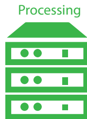
Elastic Search Cluster