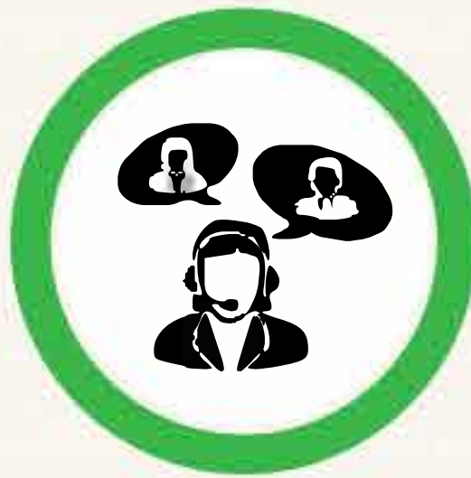
Interact with customers across platforms