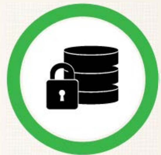
Maintain customer privacy & confidentiality