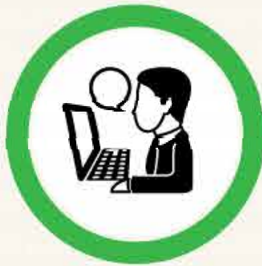
Ensure information integrity