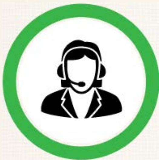
Improve customer service