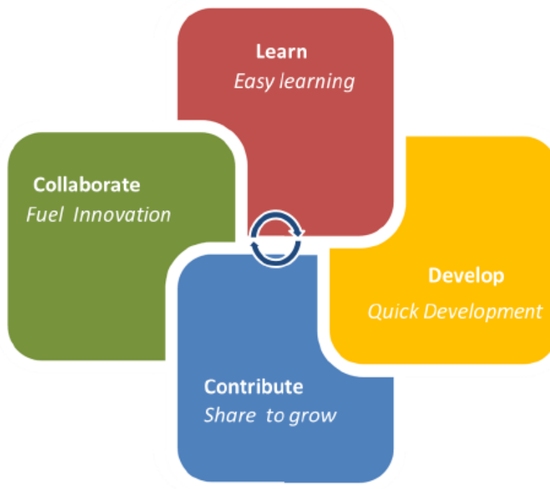
Fig 2 : Developer Portal Parameters