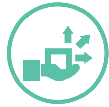
Deeper Predictability on Demand, Availability, Stock Replenishment