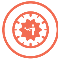
Event Driven & Real-Time Business Actions