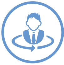
Context Aware Customer 360