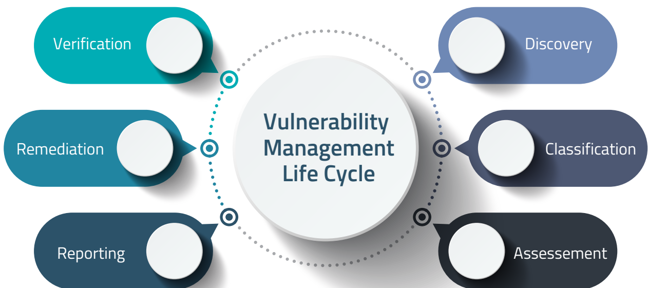
Figure 1: Vulnerability Management Life Cycle