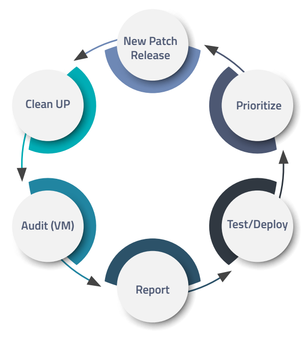
Figure 3: Patch Management

Patch management makes the process simple and easy to manage the patches and helps to acquire the patches, installing and then testing them. It helps to keep the system updated on all the security patches available. It also decides which patch should be used or which shouldn't be.