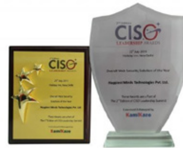
ciso-leadership-award- overall-web-security-solution- year-2019