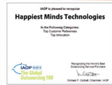
IAOP-Best of the Global Outsourcing 100 list