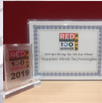
Top 100 Asia Award