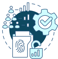
Identity Management & Access Governance Offerings