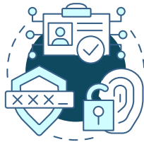
Access Management Offerings