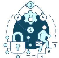
Privileged Account Management Offerings