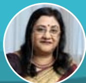
Arundhati Bhattacharya Salesforce India